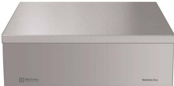
589164 (MCNABAHO00) Closed Work Top, one-side operated